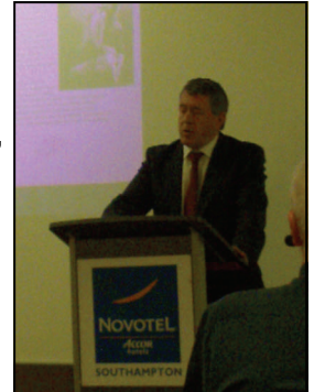
John Denham MP on 26 March 2010